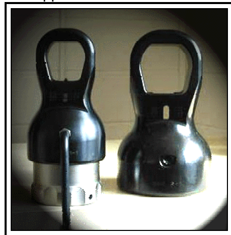
Single Port Topside Nut Splitter