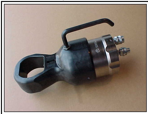
Dual Port Subsea Nut Splitter

Removing corroded or seized nuts is recurring problem faced by engineers. INTEGRA's Hydraulic Nut Splitters offer a reliable, effective solution for either Topside or Subsea applications